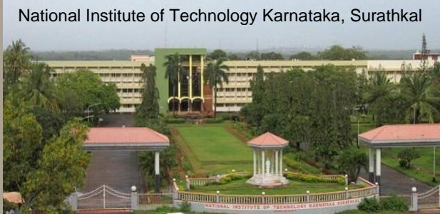
National Institute of Technology Karnataka, Surathkal